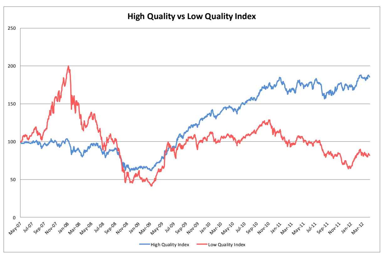
Page 3 of 6

A point to note is that the rally from the low in December has mainly been a Low Quality rally and it is this that has resulted in a correction in the ratio of High Quality vs Low Quality from January. We still struggle to find High Quality stocks with an appropriate reward-risk ratio.