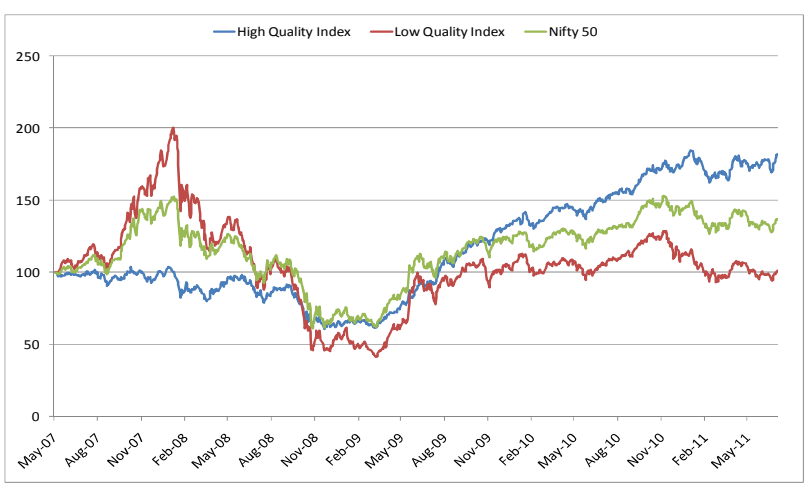
Chart 2

Based on the companies so classified in our coverage list, we maintain Index of High Quality (HQ) vs Low Quality (LQ) businesses, which give us the relative performance of high quality businesses. Chart 1 represents that index here with Standard Deviation analysis and ranges. As shown in Chart 2, since the peak of the market after the mad race of 2007, and subsequent periods of free fall and recovery, these high quality companies have performed very well, mainly as market participants adjusted to the new normal after burning their hands.